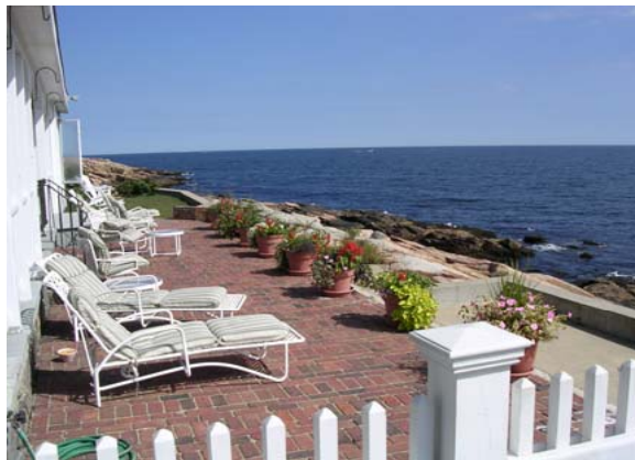
(View of brick patio)

From every room of the Inn, guests can watch lobstermen tending their traps, fishermen working their craft and sailboats heeling in the wind - all against the background of Thacher Island with its historic twin lighthouses.