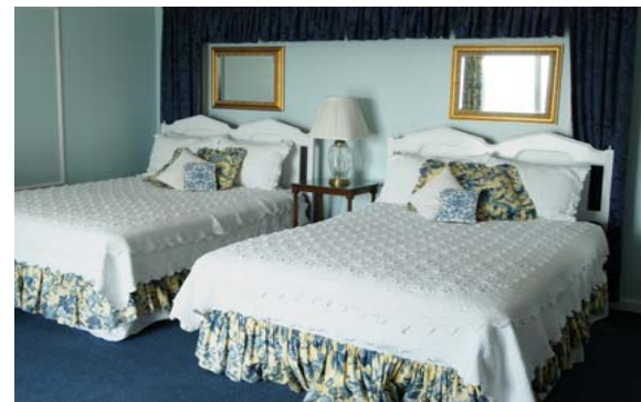
(Sloop Suite - Room #4)

The Inn's bedrooms offer panoramic views of the ocean and all have private balconies to enjoy the seaside air. All rooms have elegant private bathrooms, sitting areas and air conditioning. Rooms are available with king or queen size beds.