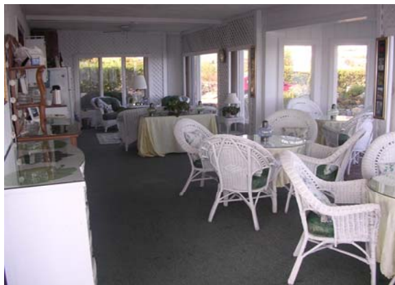
(Sun-filled breakfast room)

Eden Pines Inn offers its guests a complimentary continental breakfast, afternoon cookies and assorted beverages throughout the day. In the evening enjoy a cool breeze and a cocktail (BYOB as Rockport is a dry town) on the porch as the moon rises on the water in front of you.