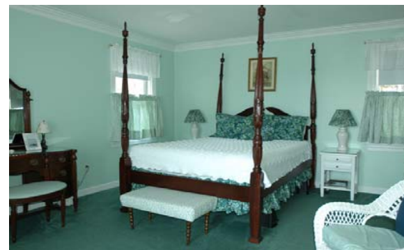
(O'Day Suite - Room #6)

The Inn's bedrooms offer panoramic views of the ocean and all have private balconies to enjoy the seaside air. All rooms have elegant private bathrooms, sitting areas and air conditioning. Rooms are available with king or queen size beds.